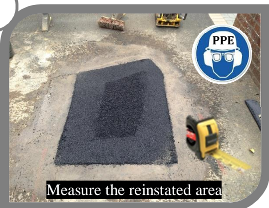
Measure the reinstated area

Using a 1400-1800 vibrating plate compact a maximum of 40mm with 6 passes Or using a 600-1000kg roller 10 passes