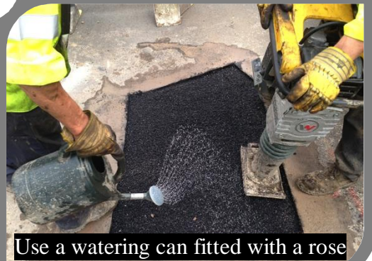
Use a watering can fitted with a rose